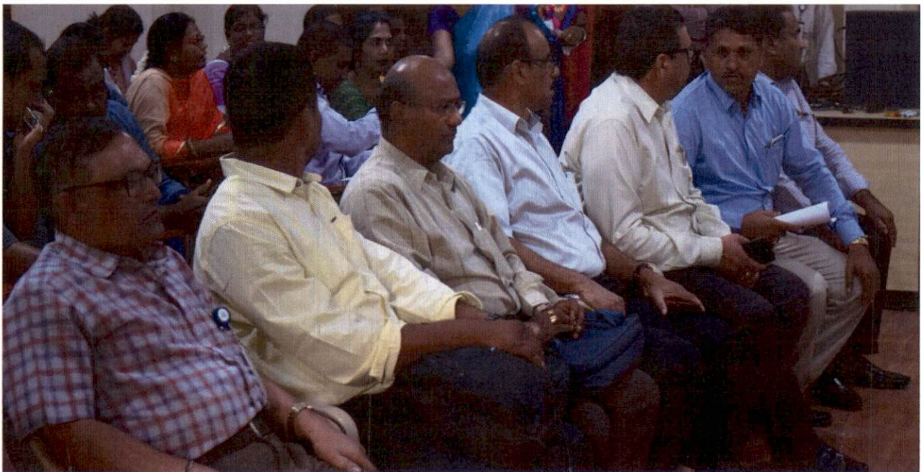
Celebrations of Babu Jagjivan Ram Jayanthi on 05/04/2017